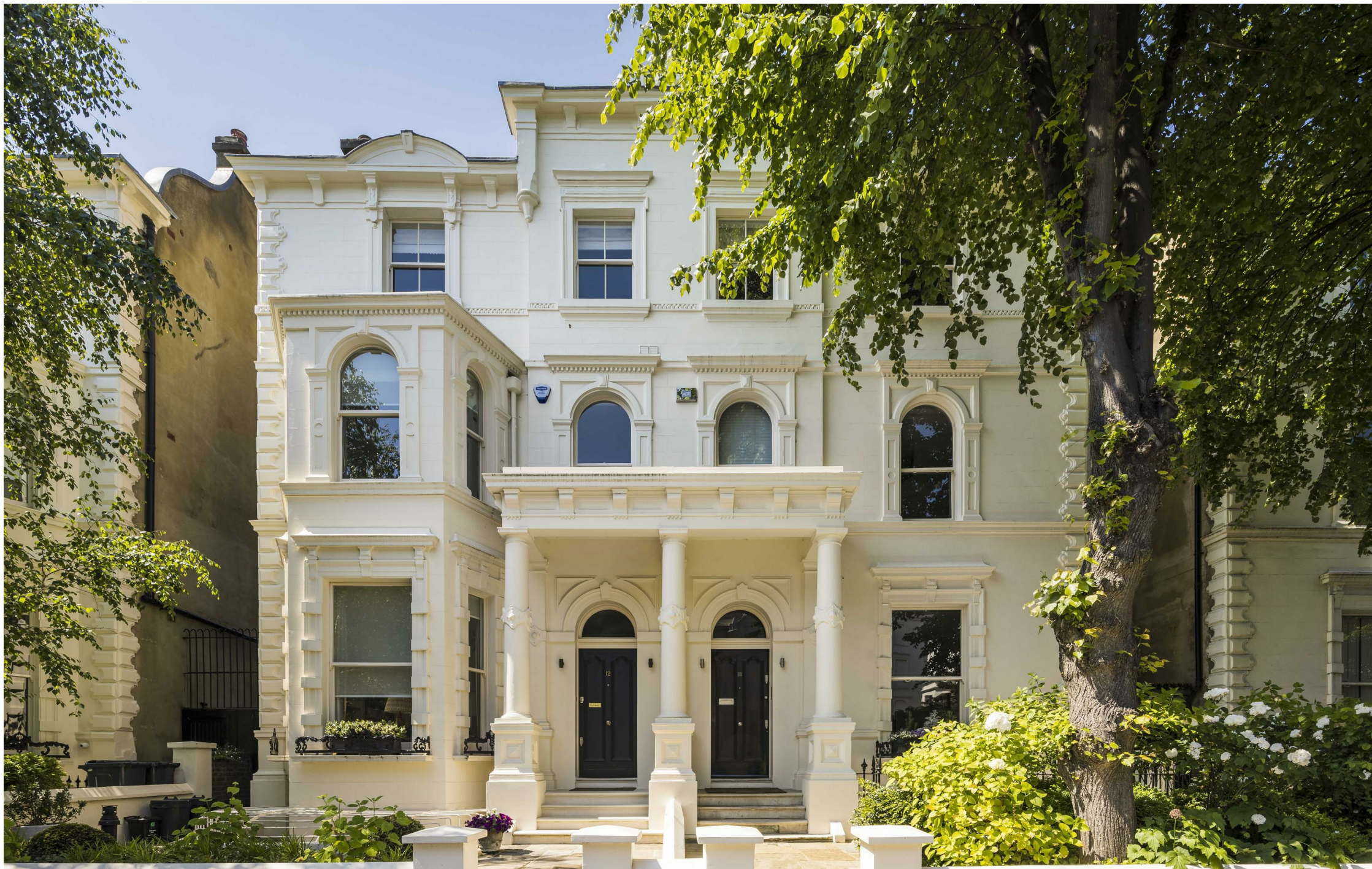
11 Randolph Road, London W9 1AN Asking price £10,750,000 Freehold