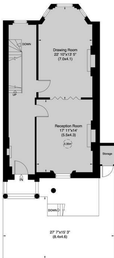
Raised Ground Floor